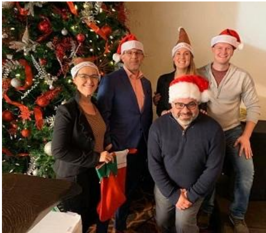
2019 Christmas Luncheon