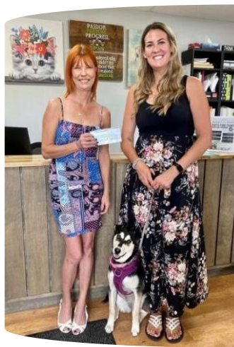
2022 Saving Grace Animal Shelter