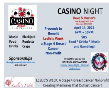
April Casino Night