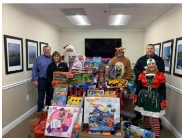
Dec Toy Drive