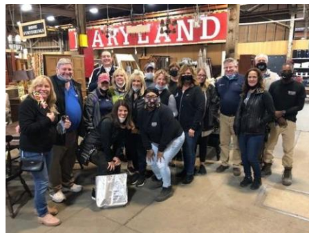
Oct Second Chance