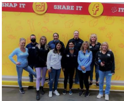
Oct Food Bank