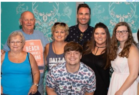
Blue Goose First Family