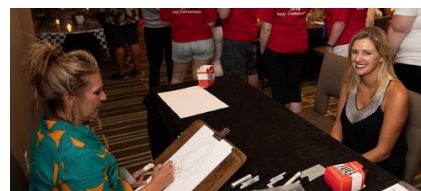
Caricatures' were done at the Welcome Party