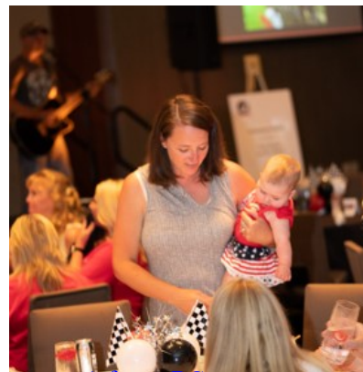
A future BG prospect