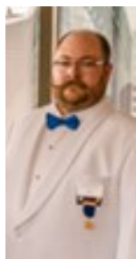
The Newest Grand Nest Officer