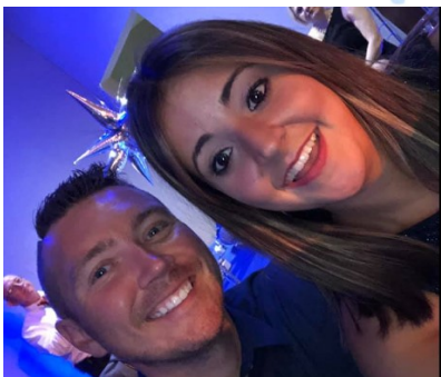
Blue Goose family members