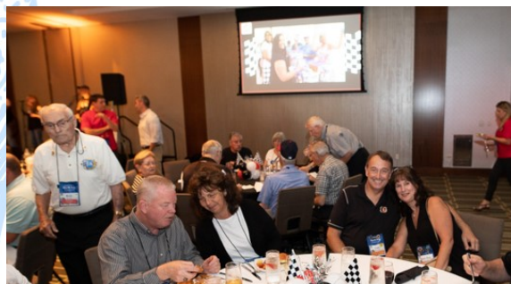
Member enjoying themselves at the opening ceremony. On the screen at back are slides from previous conventions