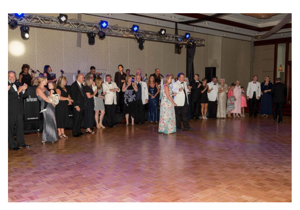
The Grand Ball culminates a grand convention. Everyone looking their finest.