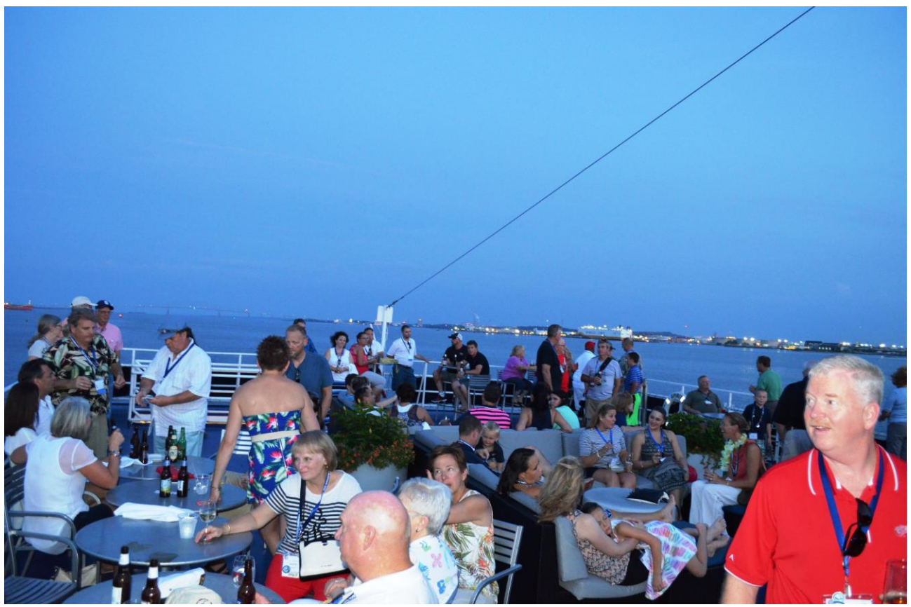
Sailing around the Inner Harbor on the Spirit of Baltimore. A family evening of great enjoyment – a great dinner and wonderful sights along the harbor for all to enjoy.