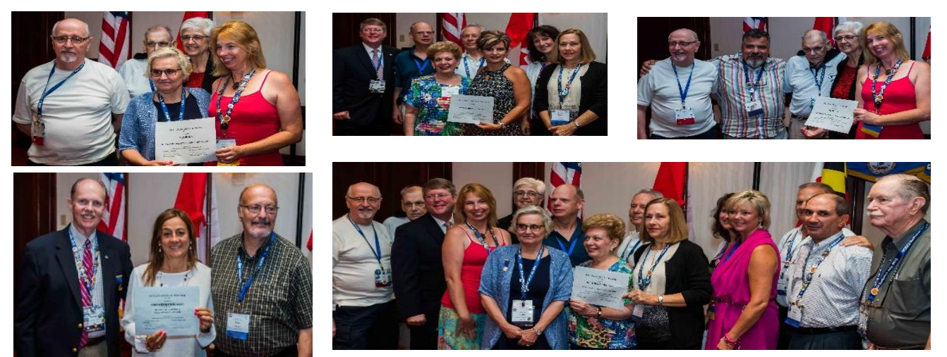
The Regional Awards were next.