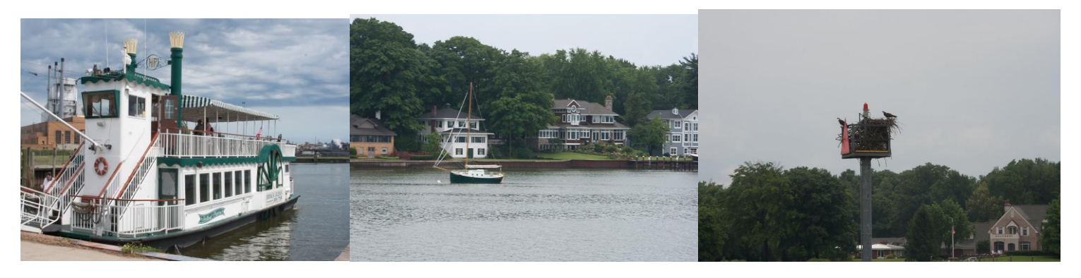
A free afternoon of sailing on the Great Lake Michigan. Seeing the houses along the water front, watching the bald eagles managing their nest, and oh the entertainment from the ranks of the attendees.